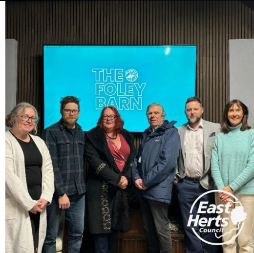
Figure 10 The Foley Barn