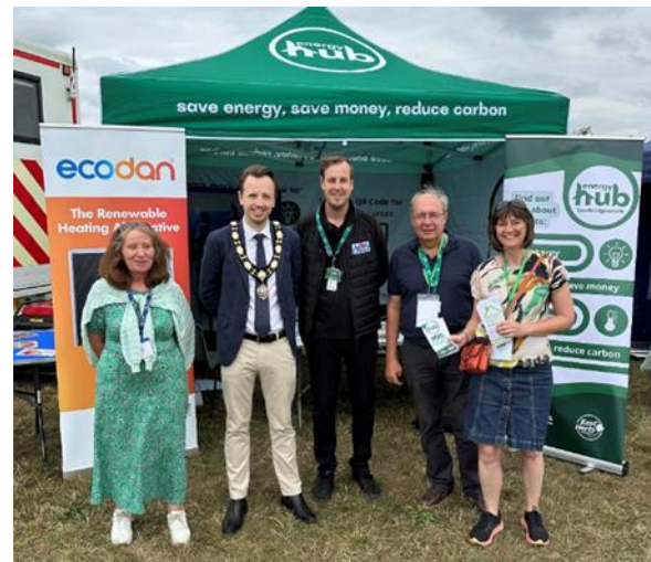
Figure 6 Energy Hub in Sawbridgeworth

Increasing extreme weather events underscore the urgent need for climate action. In East Hertfordshire, rising energy costs and resource constraints have further complicated the challenge of delivering net-zero initiatives. Recognising these pressing issues, East Herts Council made its Climate Declaration in 2019 and amplified it to an Emergency in 2024, committing to ambitious targets to reduce emissions and adapt to the impacts of climate change across the District.