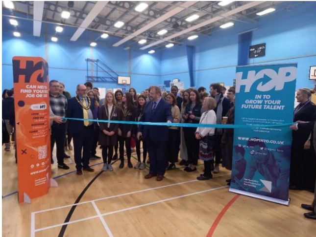
Figure 15 Launch of Generation Stortford

In conjunction with Hertfordshire Futures we have also delivered the following: