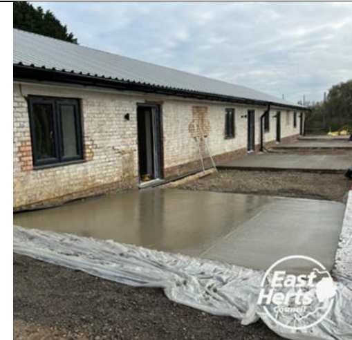
Figure 14 works in progress at Skill at Arms