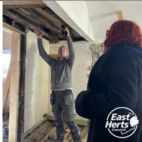
Figure 13 works taking place at the Black Horse