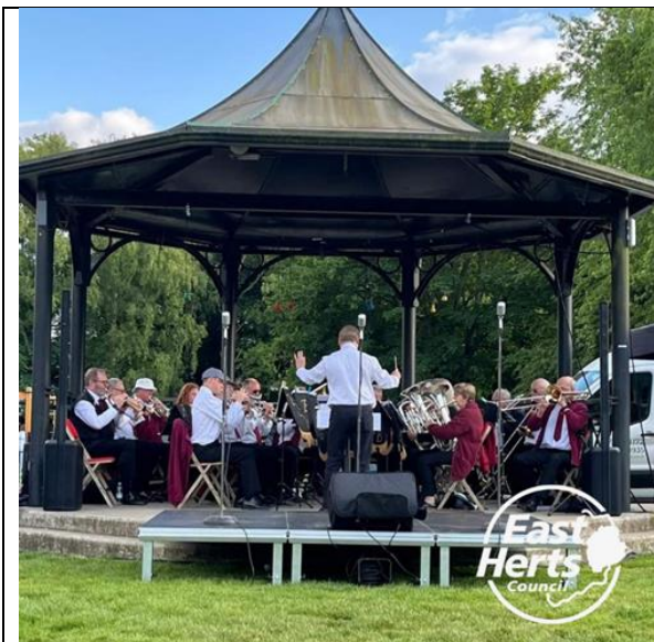
Figure 1 Bishop's Stortford Band

Furthermore, the showcase provided 213 volunteering opportunities for people to make connections, build their CVs or simply give back to their communities.