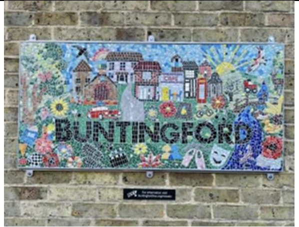
Figure 4 Buntingford mosaic