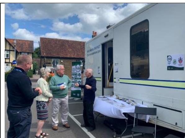
Figure 7 Energy hub in Sawbridgeworth

With funding, logistical support, and community leadership, the Energy Hubs are a scalable, replicable model for other communities. Success breeds success, inspiring further action and innovation.