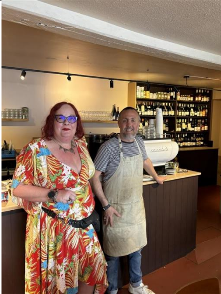
Figure 9 Le Peche Mignon