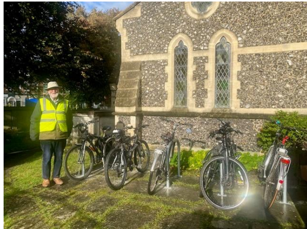
Figure 5 Bike Racks installed at St Andrews Church, Hertford