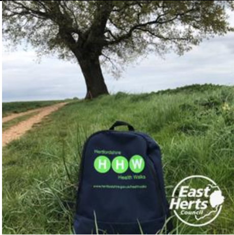
Figure 3 Hertfordshire Health Walks