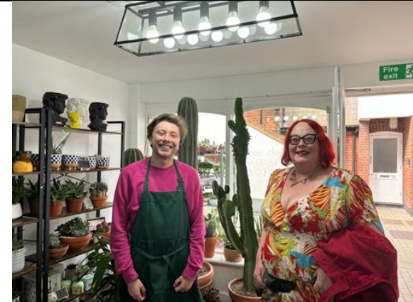
Figure 11 House Plants Express

To date, through all the grants given out we have leveraged around £750k in additional, private sector investment in the district and created or safeguarded 10 jobs